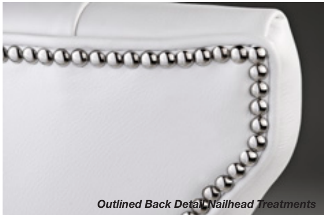
Outlined Back Detail Nailhead Treatments