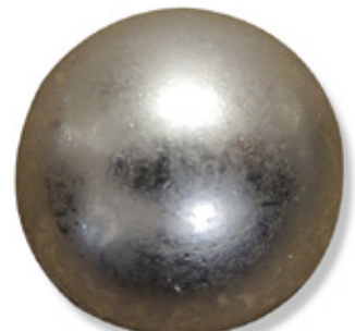
Large Pewter — 7/8" (satin pewter finish)