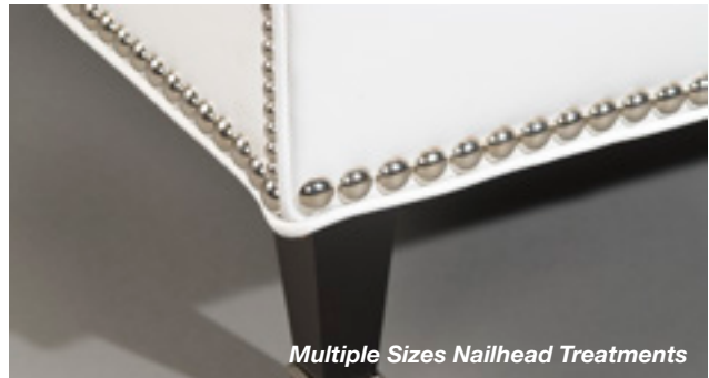
Multiple Sizes Nailhead Treatments