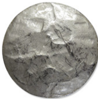
Large Pewter Hammered — 7/8" (dull hammered finish)