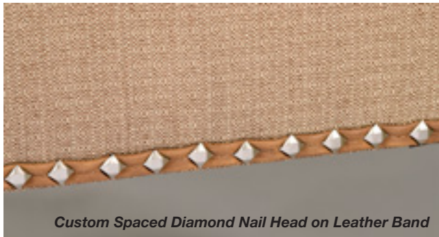
Custom Spaced Diamond Nail Head on Leather Band