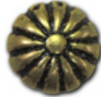
Decorator — 3/8" (shiny finish)