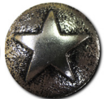
Star Medallion — 7/8" (dull steel finish)

Note: Due to color variances when printing, the colors you see may not be the exact representation of the finish color.