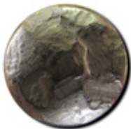
Hammered — 1/2" (dull hammered finish)