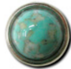
Turquoise — 3/8" (turquoise stone)