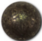
Small Rustic — 3/8" (dull stipple finish)