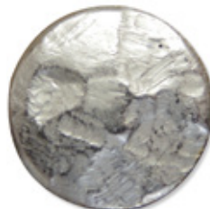
Small Pewter Hammered — 5/8" (dull hammered finish)