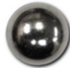
Stainless Steel — 3/8" (bright steel finish)