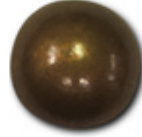
French Natural — 3/8" (dull lacquer finish)