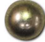
Gilt Bright Brass — 3/8" (bright brass finish)