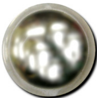
Large Chrome — 7/8" (silver finish)