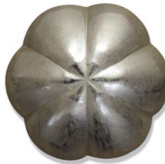
Scalloped Pewter — 7/8" (dull pewter finish)