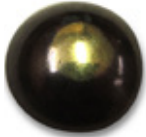
Antique — 3/8" (dull antique finish)

NOTE: nail head trims shown at approx 200% of actual size