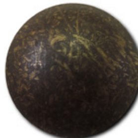
Large Rustic — 3/4" (dull stipple finish)