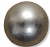
Small Pewter — 7/16" (satin pewter finish)